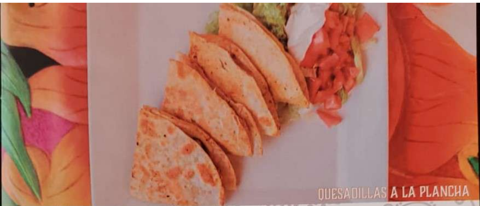
QUESADILLAS A LA PLANCHA